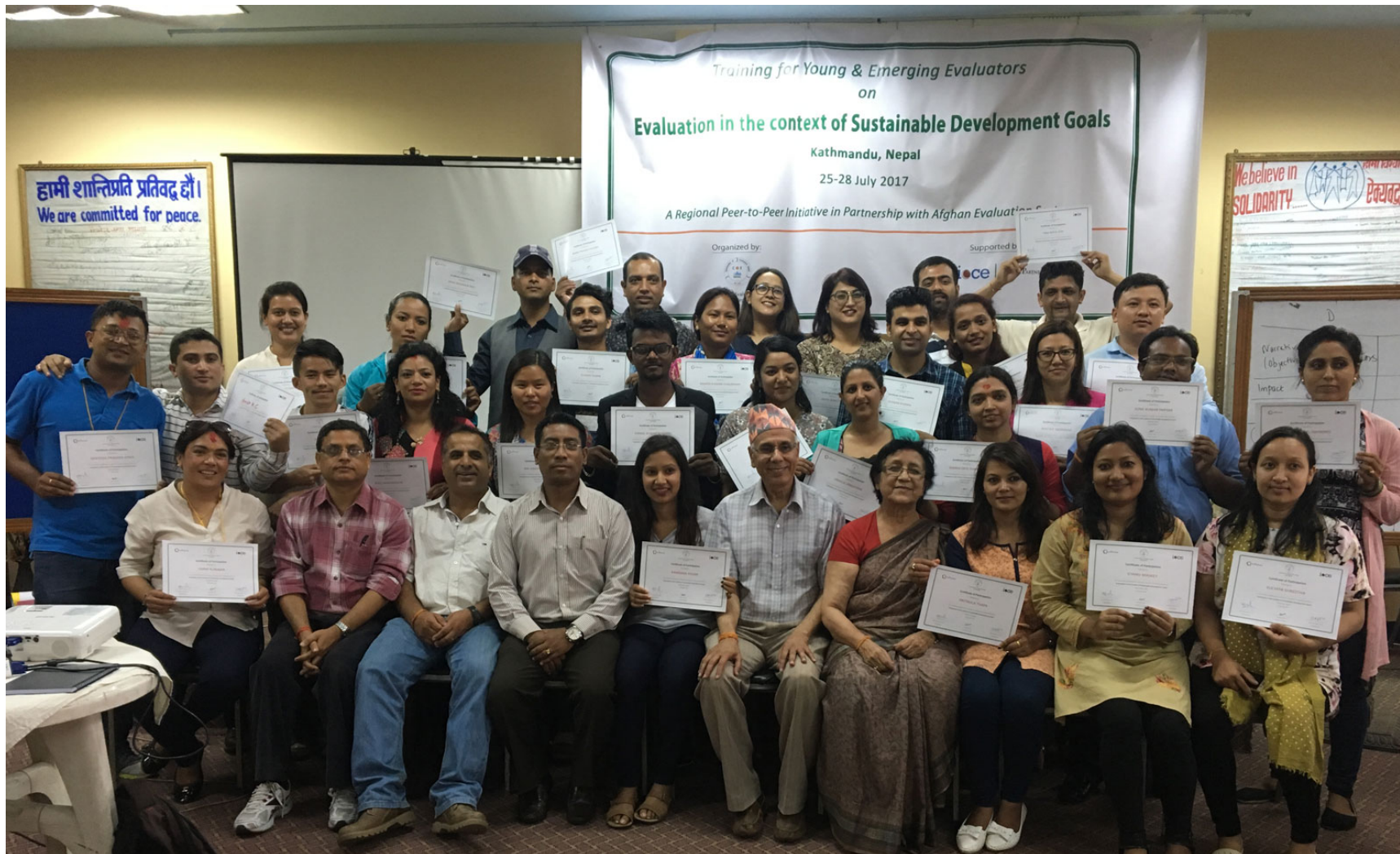
Annex 5: YEE Training Group Photo